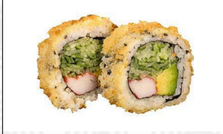
159 California Tempura Roll