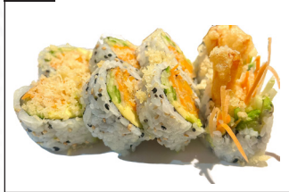
190 Veggie Queen Roll