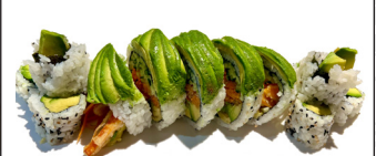
149 Veggie Dragon & Avocado Roll