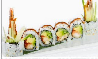
170 Shrimp Dynamite Roll