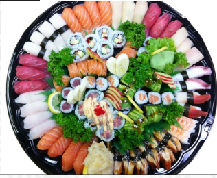
193 Extra Large Sushi