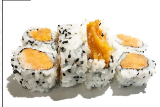
187 Sweet Potato Roll