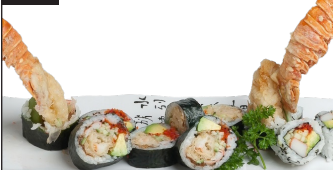
129 Lobster Roll