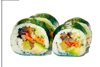
189 Vegetable Futo Roll