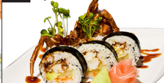
130 Spider Roll