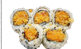
173 Spicy Crunch Roll