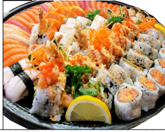
194 Large Sushi