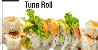
153 Golden Dragon & Tuna Roll