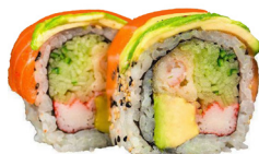
121 Golden Dragon Roll