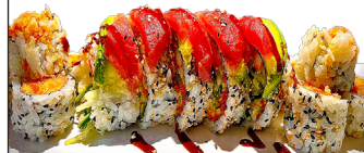
148 Red Dragon & Salmon