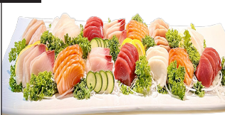
203 Extra Large Sashimi