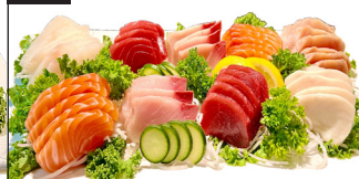
205 Family Sashimi