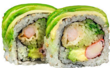
120 Green Dragon Roll