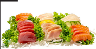
207 Medium Sashimi